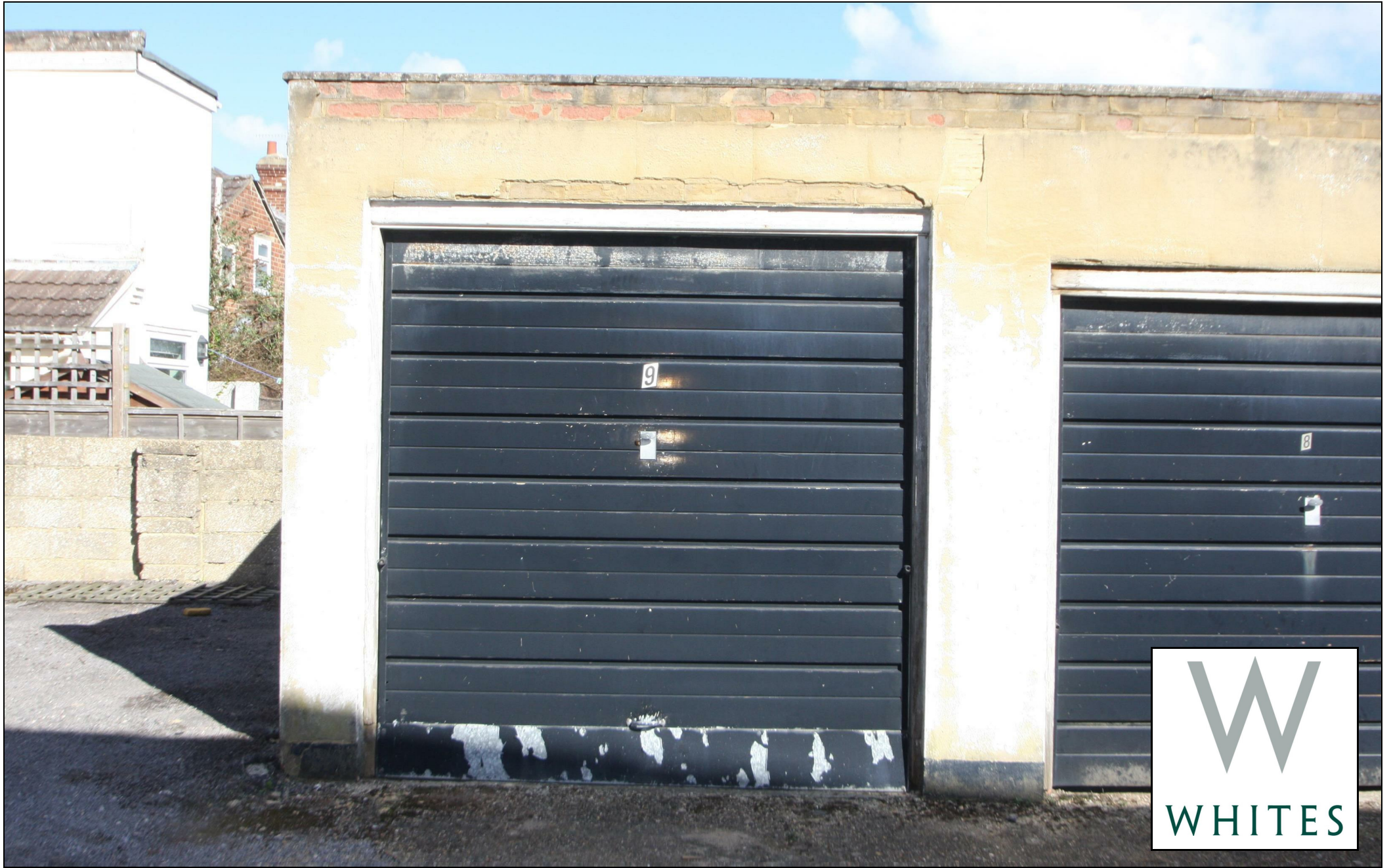
Garage 9 Cleveland Flats, Fairview Road, Salisbury, Wiltshire, SP1 1JY